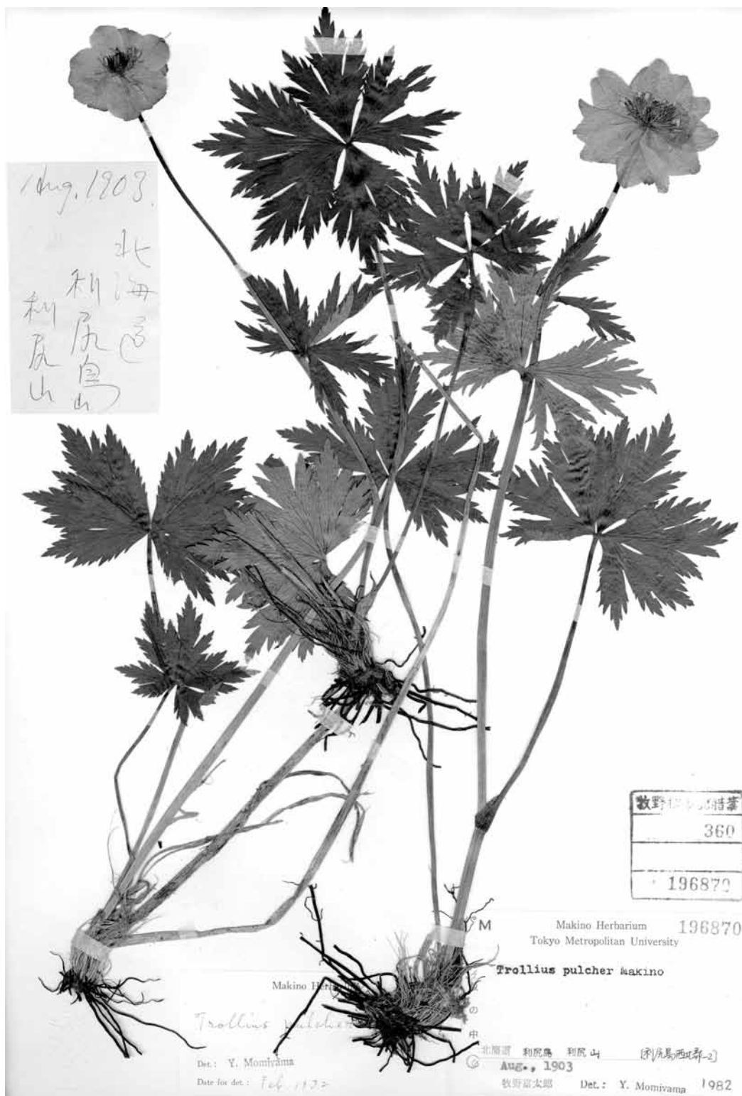
Fig. 5. Holotype of Trollius pulcher Makino (T. Makino s.n, MAK 196870).