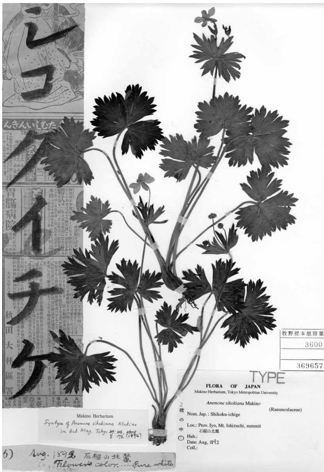
Fig. 1. Lectotype of Anemone narcissiflora L. var. shikokiana Makino (K. Okudaira s.n., MAK 369657).