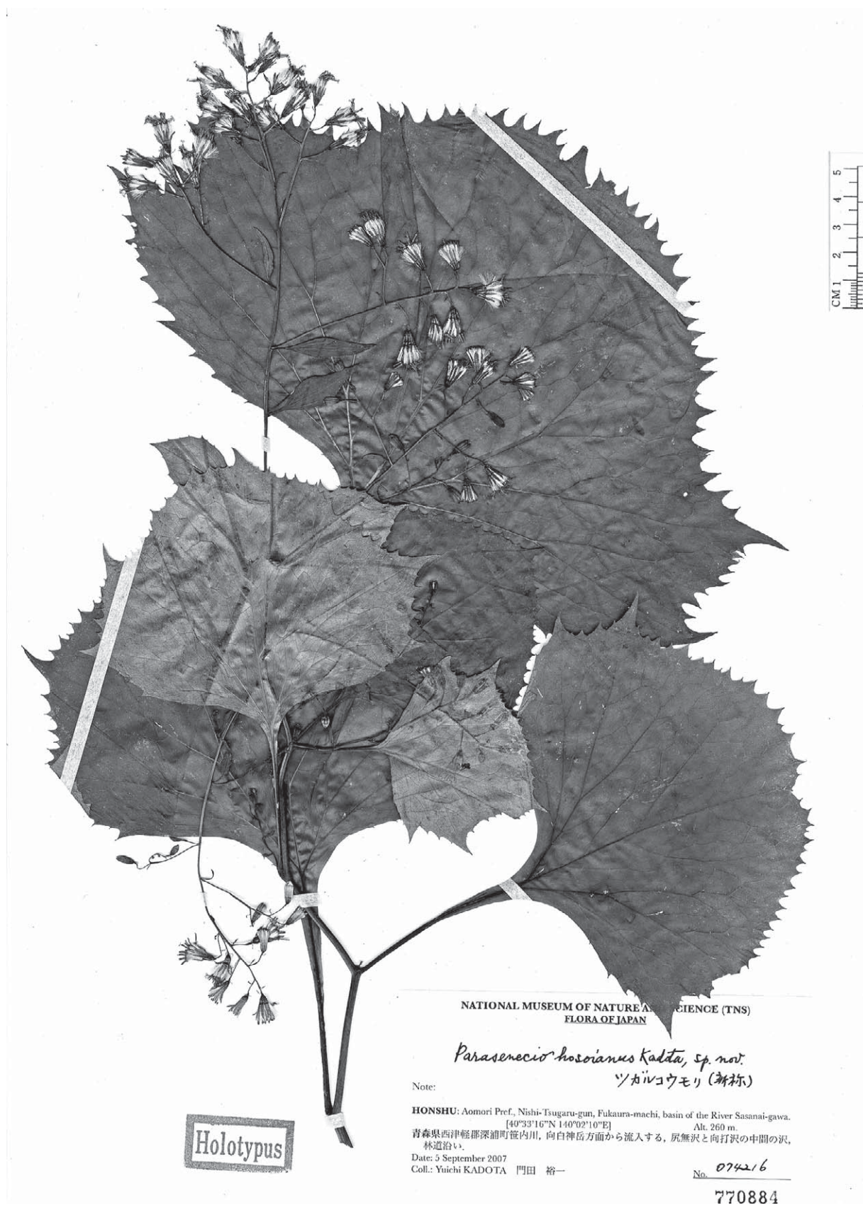
Fig. 2. Type specimen of Parasenecio hosoianus Kadota (JAPAN: Honshu; Aomori Pref., Nishi-Tsugaru-gun, Fukaura-machi, along the River Sasanai-gawa, alt. 260 m, 5 Sept. 2007, Y. Kadota 074216 (TNS 770884, holotype).