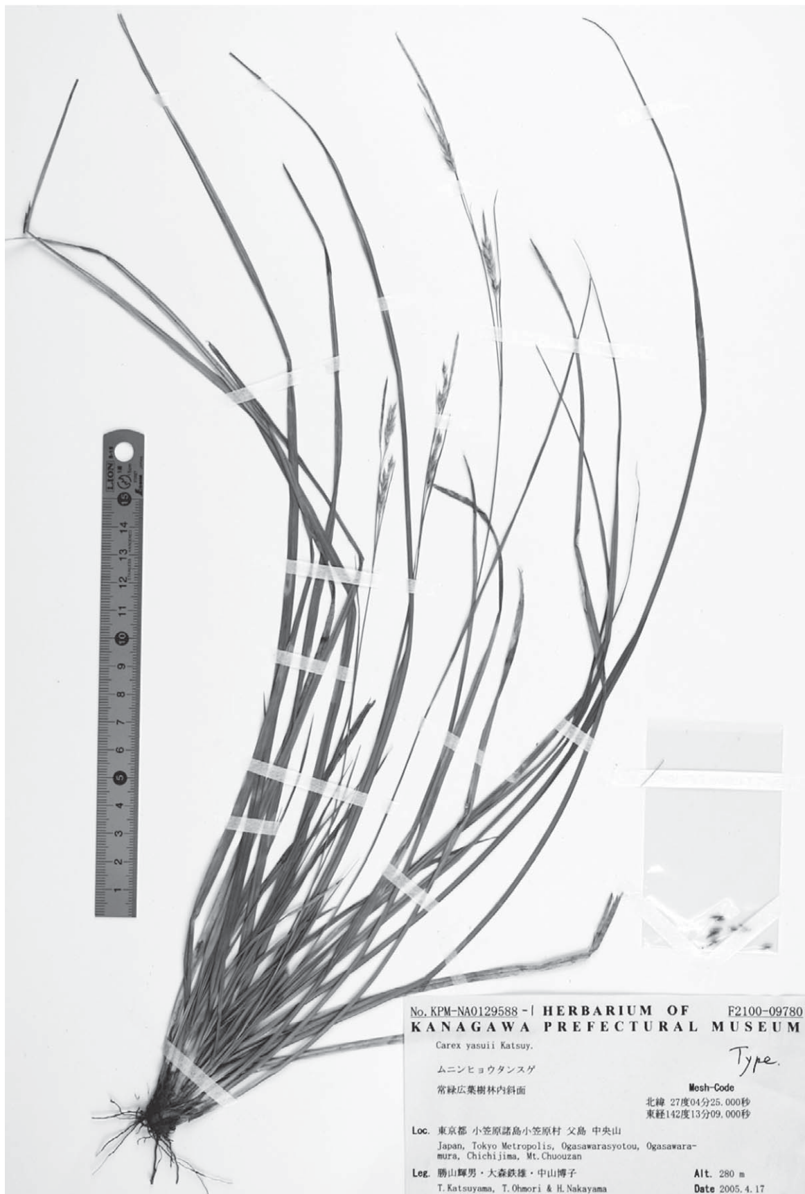
Fig. 3. Holotype of Carex yasuii Katsuy. Japan: Tokyo Pref., the Ogasawara Islands, Chichijima Island, Mt. Chuou-zan, alt. 280 m, 17 Apr. 2005, T. Katsuyama & al. s.n. (KPM-NA 0129588).