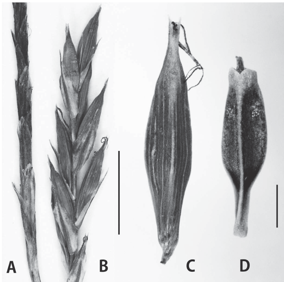
Fig. 4. Staminate spike (A), pistillate spike (B), perigynium (C) and achene (D) of Carex yasuii Katsuy. (KPM-NA 0129588). Scale = 5 mm (A–B) and 1 mm (C–D).

white to pale brown, midrib green, acute to short aristate. Pistillate scales narrowly ovate, 3–4 mm long, shorter than perigynia, white to pale brown, midrib green, acuminate to short aristate. Perigynia erect, gourd-like lanceolate, acutely trigonous, 4.5–5.5 mm long, 1–1.2 mm wide, membranaceous, finely many-veined, glabrous, stipitate, attenuate to beaks, margins of beak scabrous, apex bidentate (Fig. 4 C). Achenes tightly enveloped with the perigynia, lanceolate, trigonous, 3.5–4 mm long, brown at matur-