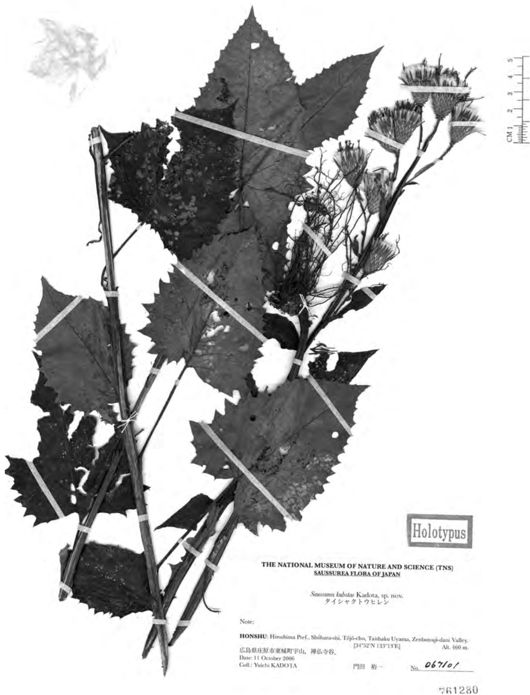
Fig. 1. Holotype specimen of Saussurea kubotae Kadota (JAPAN: Honshu, Hiroshima Pref., Shōbara-shi, Tōjō-cho, Taishaku Uyama, alt. 460 m, 11 October 2006, Y. Kadota 067101, TNS 761280).