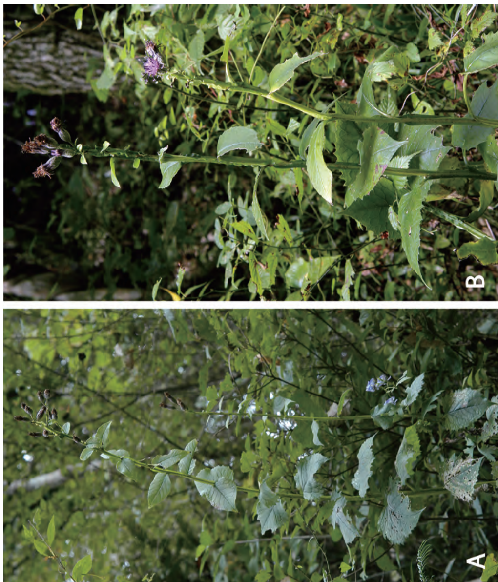
Fig. 2. Comparison between Saussurea kubotae (A) and S. tanakae (B) in habit. Both taken from Taishaku Uyama, Tôjô-cho, Shôbara-shi, Hiroshima Pref., Japan on 11 October 2006.