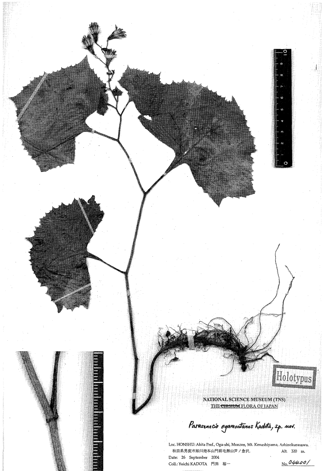
Fig. 1. Type specimen of Paraseneoia ogamontanus Kadota (JAPAN: Honshu; Akita Pref., Oga-shi, Oga Peninsula, Mt. Kenashiyama, Ashinokura-sawa Gorge, alt. 320 m, 28 September 2004, Y. Kadota 044001 (TNS 733962–holotype). Left corner inset shows auriculate petiole base.