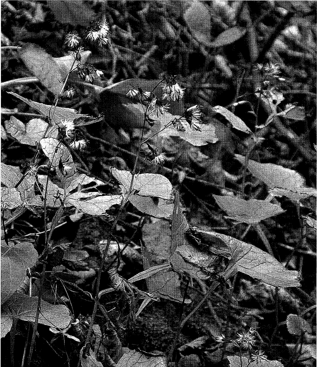
Fig. 2. Habit of Parasenecio ogamontanus Kadota (JAPAN: Honshu; Akita Pref., Oga-shi, Oga Peninsula, Mt. Kenashiyama, Ashinokura-sawa Gorge (on 26 September 2004).

are depressed pentagonal-reniform in outline and are very shallowly 5-lobed with short and acute lobes. No species with such leaf blades have yet been reported in Parasenecio (Kitamura 1938, Koyama 1967, 1968a,