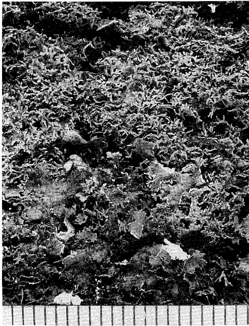
Fig. 5. Part of lectotype of P. pseudolaevior , showing dorsiventral lobules. Scale indicates mm.