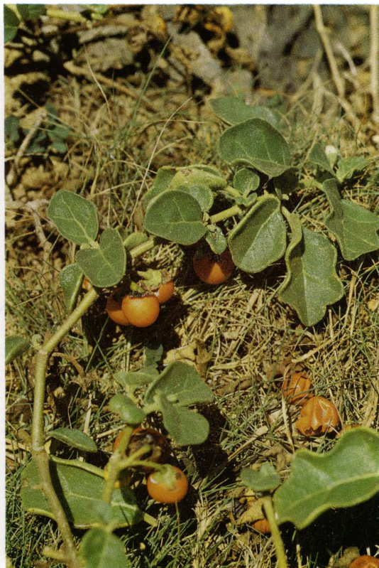
Fig. 2. Solanum miyakojimense Yamazaki et Takushi. Pref. Okinawa, Miyako Is., cult. Okinawa.

Irahama, on a rocky bluff along the seashore (Takushi, Feb. 28, 1990, TI).