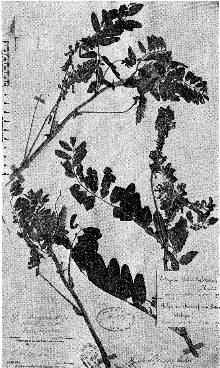
Fig 1. Holotype of Hedysarum strobiliferum Baker (= Astragalus Bakeristrobiliferus Ohashi).