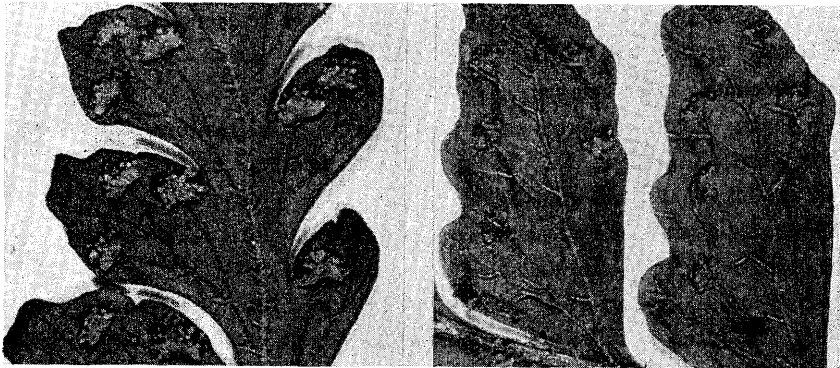
Fig. 2. Under surface of pinnulae of M. obtusiloba . (left, var. obtusiloba ; right, var. angustata )

Distr. Japan (Ôsumi-peninsula of Kyushu and Isl. Yakushima), Ryukyu and Taiwan. Ching reported the present species from the mainland of