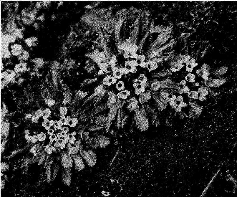
Fig. 1. Pegaeophyton bhutanicum Hara. \times ca. 3/4.

30) Pegaeophyton bhutanicum Hara, sp. nov. (Fig. 1, 2)