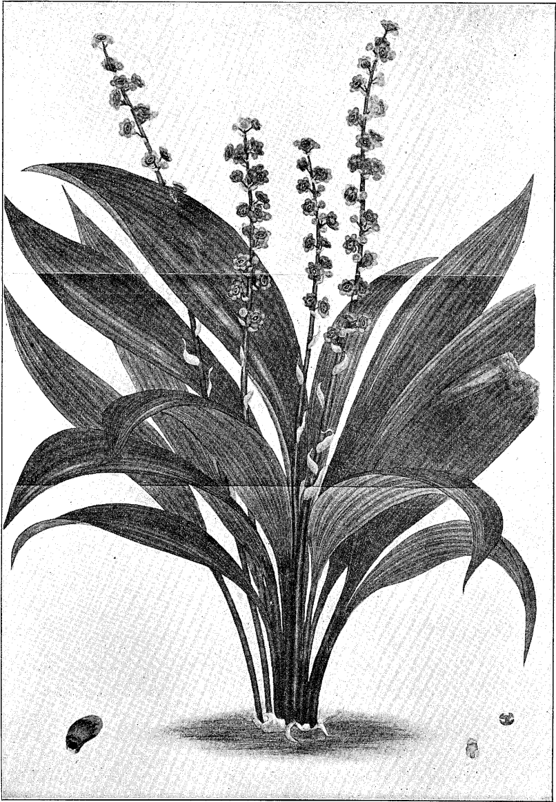
Fig. 3. ANDREWS 氏著 Botanists Repository 第9卷 = 1810年 = 畫解サレタ Pezomachus Teta ヲ縮寫ス。原圖ハ彩色畫ナリ。