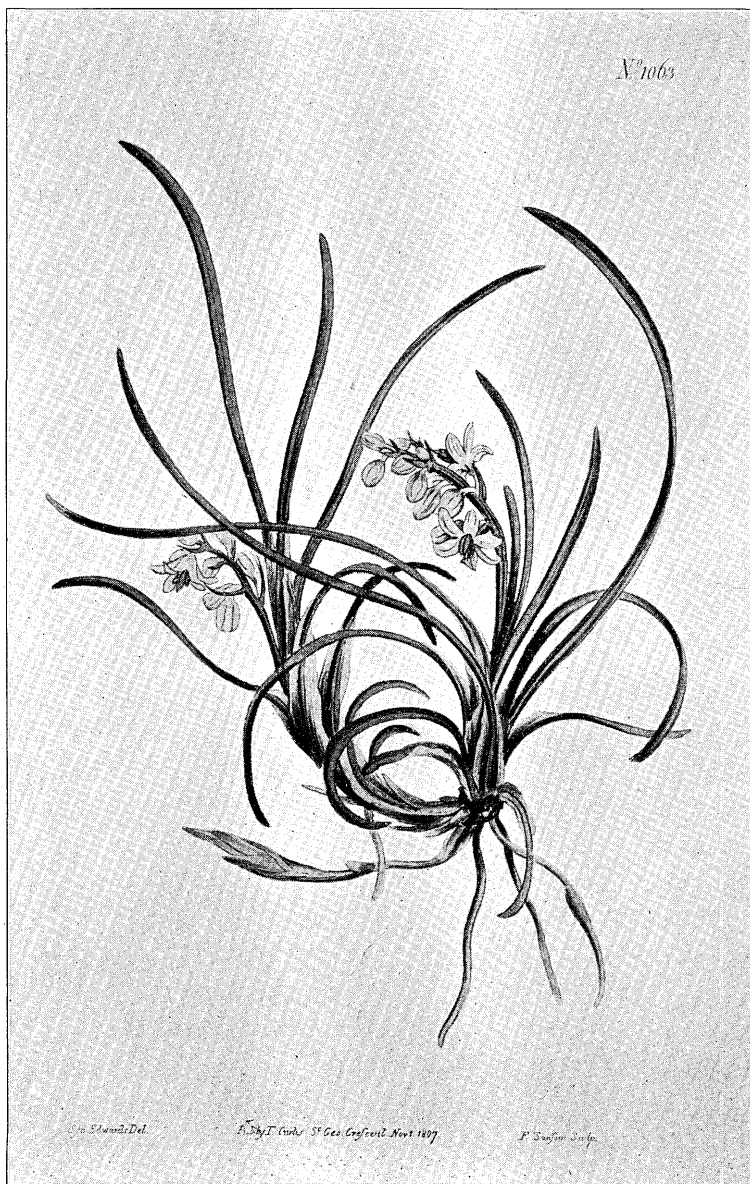
Fig. 2. KER-GAWLER氏ガ1807年 = SIMS氏監修ノ Botanical Magazine = 畫解シタジャのひげヲ縮寫ス。原圖ハ彩色畫ナリ。